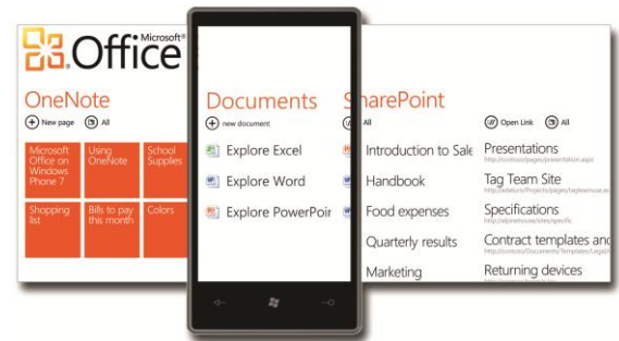
The Office Hub for Windows Phone for anywhere access to documents

That is why we recommend Microsoft® Office 365 for your business. Office 365 brings together Office 2010 with cloud-based shared documents, instant messaging, web conferencing, and the power of Exchange Online, the industry’s leading business-class email with 25GB mailboxes and built-in layers of antivirus and anti-spam protection. So why should you care?